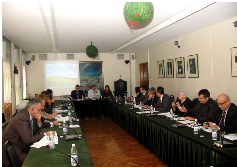
The meeting of the Macedonian delegation with representatives of the Center for the Study of Democracy, 26 November 2010

the Supreme Judicial Council and the management of the national media, regarding the procedure for the election of a new Chairman of the Supreme Administrative Court. The letter emphasized that the public confidence in the judiciary can be developed and strengthened only if every decision made by its governing body is rational, motivated, publicly accessible and in compliance with the word as well as the spirit of the law.