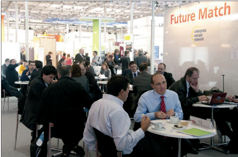
A glimpse into the FutureMatch event.

The event attracted 263 participants, presented 533 cooperation profiles from 35 countries and scheduled 1,323 meetings. The ARC Fund consultants from the network supported the participation of six innovative Bulgarian companies in the bro-