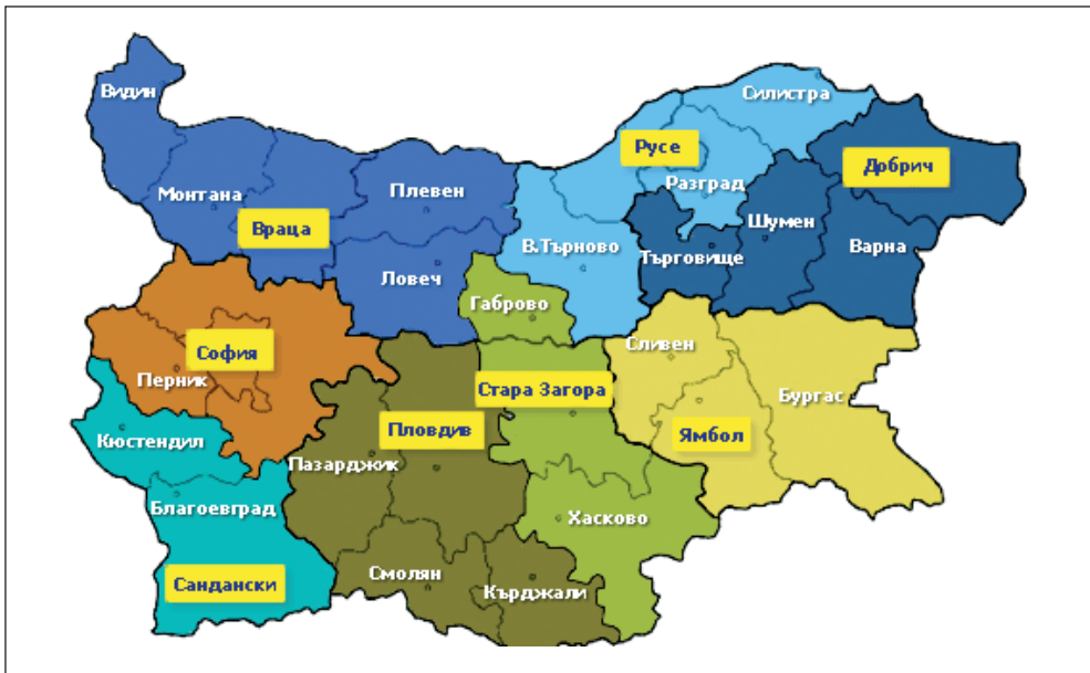
The Network in Bulgaria consists of 14 partnering organizations in 8 cities; it is coordinated by ARC Fund, and covers the whole territory of the country.

With over 3,000 professionals participating, the EEN is present in every region of the European Union and in twenty-one third country markets to serve the needs of European SMEs. It provides integrated support services designed to help small enterprises do business abroad and find European funding for their research and innovation projects. The Network was created in 2008 by DG Enterprise and Industry and is a key part of the EU's Competitiveness and Innovation Framework Program, which aims to encourage competitiveness in European businesses. It is managed by the Executive Agency for Competitiveness and Innovation (EACI).