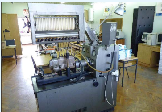
Laboratory for engines and vehicles