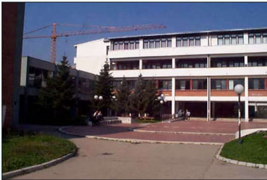
Faculty of mechanical engineering