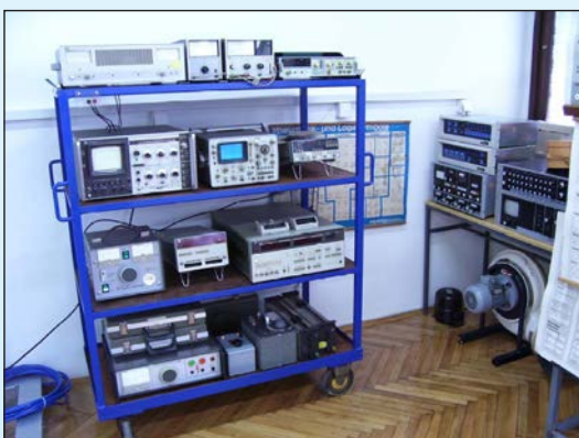
Laboratory for automation and robotics