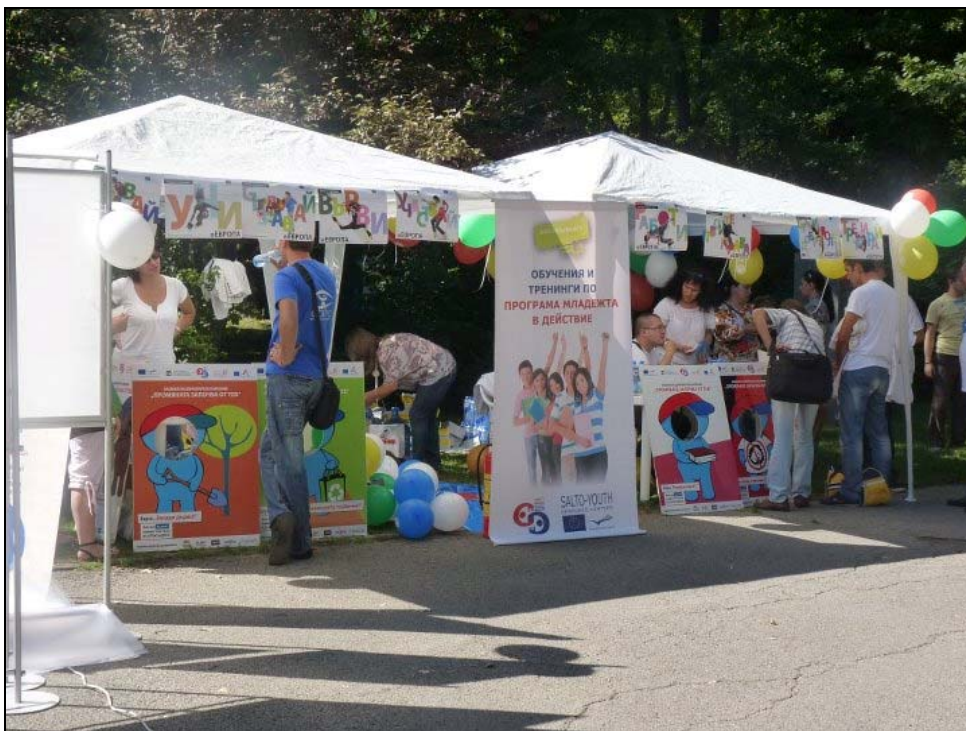
Famillathlon 2012 in Sofia

the Ecology club at the 42th School in Sofia. Another initiative of the Safer Internet Centre was the flash mob which aims to promote the safe and responsible attitude towards handling online privacy and passwords.