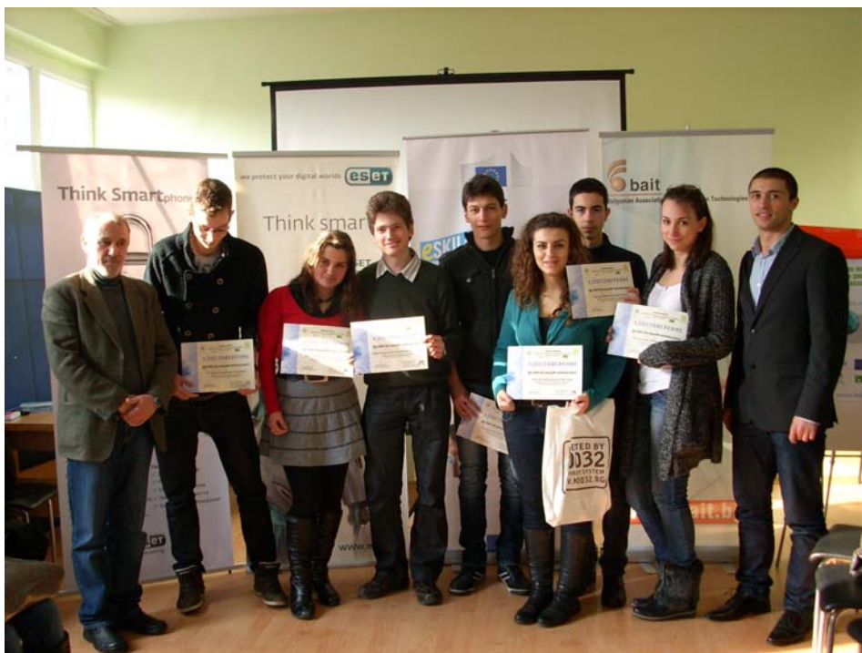
Graduates of the Safer Internet Course in Varna

students and professionals, Varna Municipality cooperates with experts from the Bulgarian Safer Internet Centre in elaborating its annual action plan for preventing internet abuses.