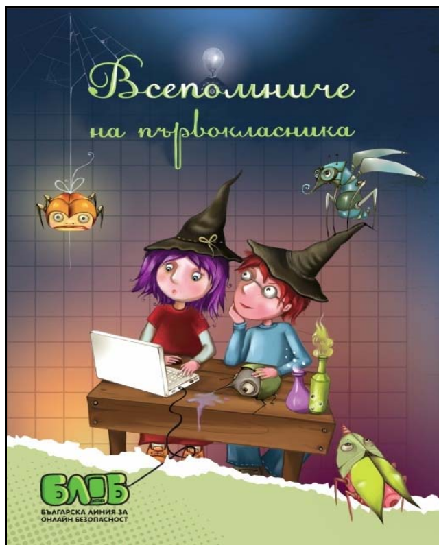
Booklet for first graders "My First Memo Book"