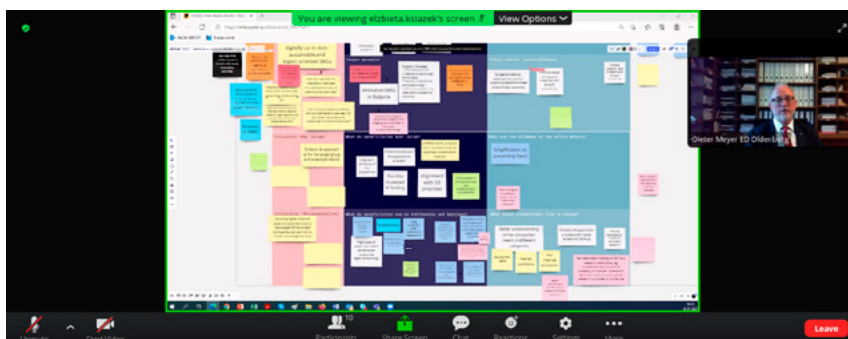
Exploiting Miro canvas for gathering ideas during the peer-review workshop, 3 November 2021

an international peer review of the National Innovation Fund (NIF), organized by Adam Mickiewicz University Foundation, Poznan Science and Technology Park, Poland; the Municipality of Gabrovo, Bulgaria; Science Park Foundation, Tartu, Estonia; and Weserbergland RDC, Hameln-Pyrmont, Germany. Each peer review session covered: 1) pandemic challenges as well as practices and tools, dedicated to identifying the needs of SMEs; 2) selection of target groups (affected by COVID) and analysis of their needs. The policy recommendations, based on this effort, will lie at the core of an Action Plan for upgrading the National Innovation Fund.