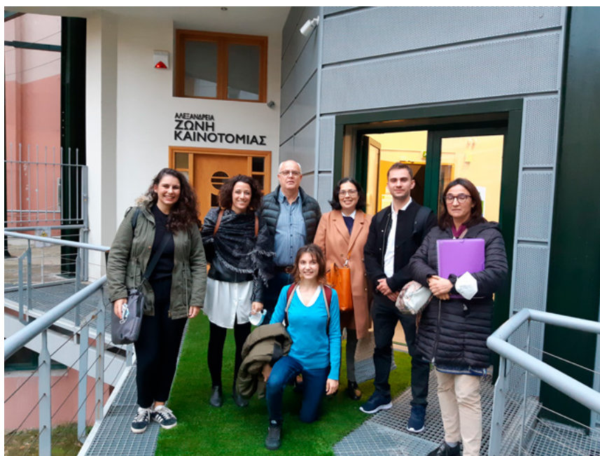
Participants in the 2nd CityZen Accelerator and 1st Action Camp event, Thessaloniki, 4–5 November 2021

system and design thinking tools proved to be particularly useful for gathering new ideas. Land scarcity, lack of UF regulations and potentials for new policies and business models were among the topics where practical solutions were sought by devising policy measures. CityZen success cases on educational UF activities, civil initiatives and specific business models were showcased to stakeholders in a Good Practices Week.