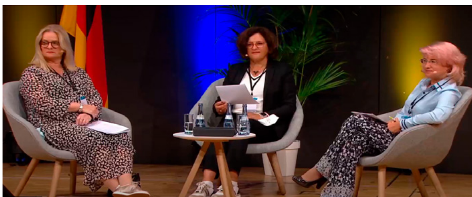
2021 Enterprise Europe Network Annual Conference, Connecting competences with the regions: reinforced role for the Network

innovation ecosystems in view of the new Cohesion Policy” brought together DG Grow, DG Regio, EISMEA, SAG Bureau and Germany and Sweden’s Network representatives. The discussion highlighted the need for synergizing the policy instruments between DG Grow and DG Regio. ARC Consulting’s representative highlighted how an integrated client-centered approach and an excellent integrator into the regional innovation ecosystem can leverage its impact well beyond the EEN’s core services.