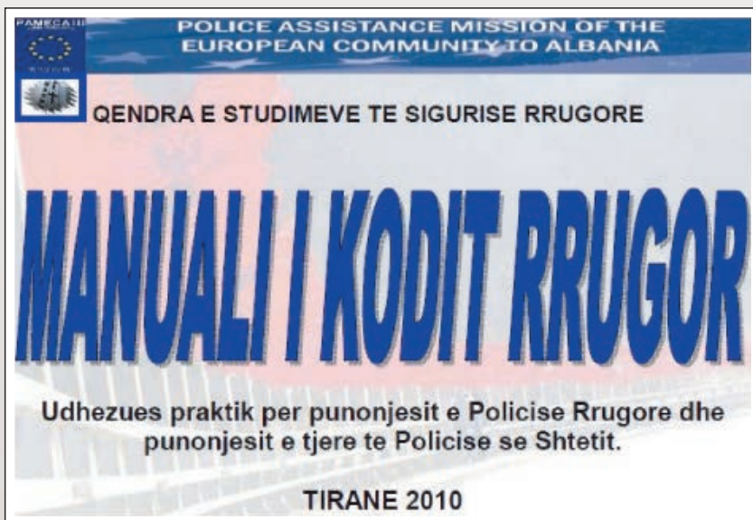
Publication Manual of the Road Code