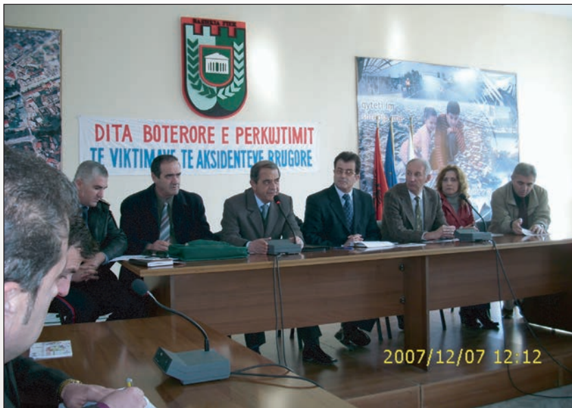
National Conference on road accidents in Albania