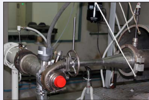
Figure 1. Laboratory for turbochargers