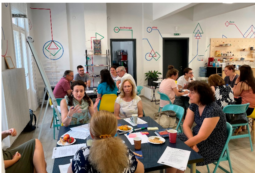
RRI participatory workshop in Sofia, 15 July 2021

An analysis of 10 national and 5 municipal strategic documents and a participatory workshop were conducted to assess the relevance of the RRI-AIRR approach for selected policy areas in Sofia municipality (support for innovation; digital transition and new skills; youth employment and entrepreneurship; sustainable urban development) and territorial policies at large.