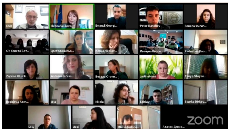
The main online event of the Safer Internet Day in Bulgaria reached more than 20,000 people, 9 February 2021

In 2021, two members of the Bulgarian SIC's Youth Panel, who are also part of the Megaphone Youth Network, maintained by the National Network for Children, as well as the Network's Reporters Initiative, completed the two-year Megaphone program successfully and were certified by the NNC. One of them also represents Bulgaria in the Eurochild Children's Council as she has been elected with the majority of the votes of the young people, involved in the Reporters Initiative. In 2021, the elected girl participated in a number of international online forums.