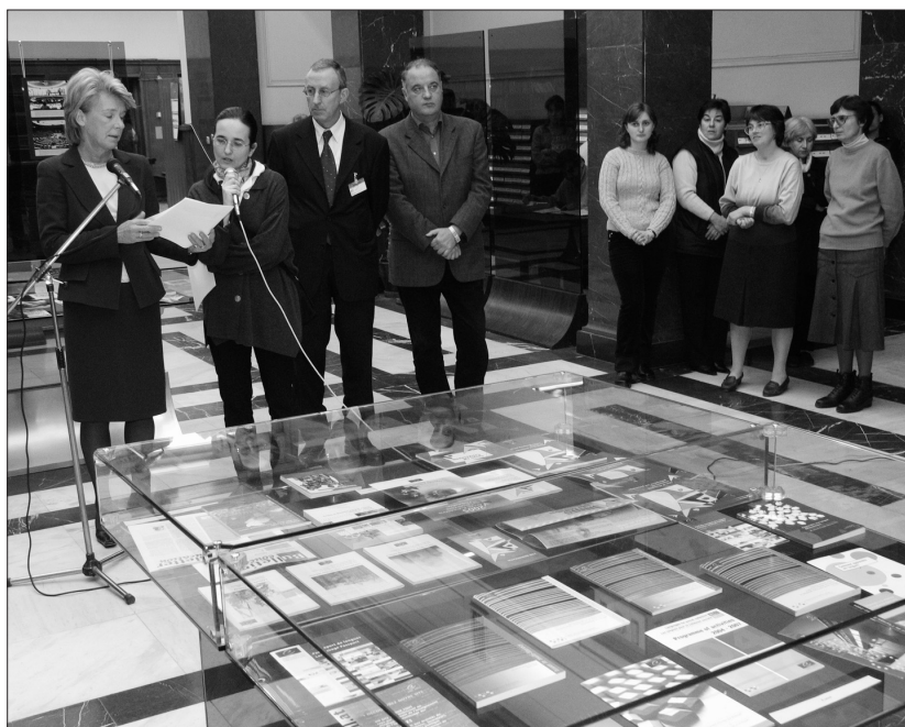
On December 13 the Deputy Secretary General Ms. Maud de Boer-Buquicchio opened the book exhibition of the IDCCE "New Council of Europe publications" at the premises of the National Library