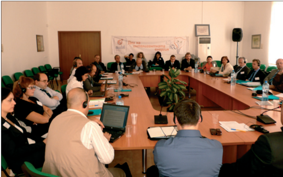
Технически университет – Габрово: дискусия за академичното предприемачество, опита на академичните инкубатори и проблемите на връзката наука-бизнес

Networking for technology transfer: AIECA 2009 offered opportunities for discussions and brokerage meetings focused on possible technology transfer projects and ideas. Members of BALA and some conference participants discussed the possibilities for developing common projects on technology transfer, incl. a project on development and implementation of new technologies in the Bulgarian manufacturers of parts and equipment for light aviation.