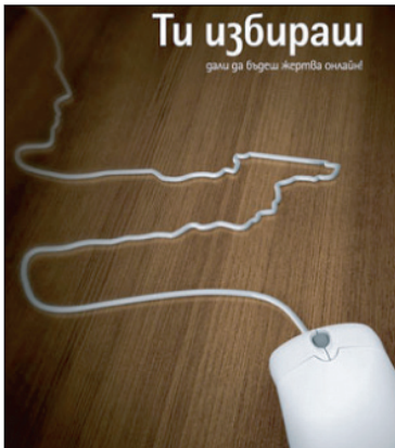
The poster of the “You Choose” campaign

The idea for the “You choose” campaign came from two Bulgarian students who had made their own spot, warning about the hazards of Internet. The spot was re-shot professionally with the participation of the children and the campaign was launched.