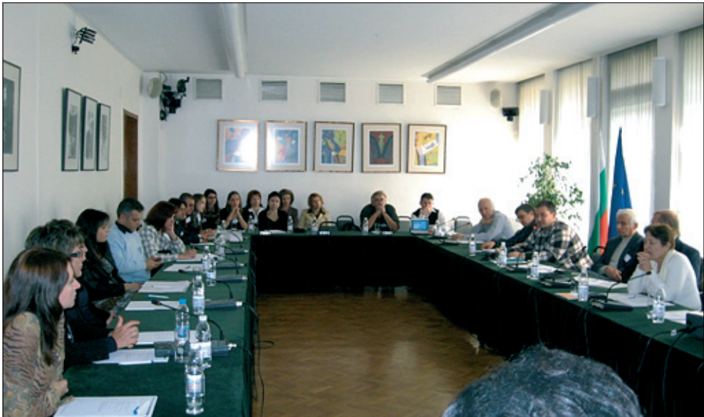
Joint seminar of Enterprise Europe Network – Bulgaria and Bulgaria's Patent Office