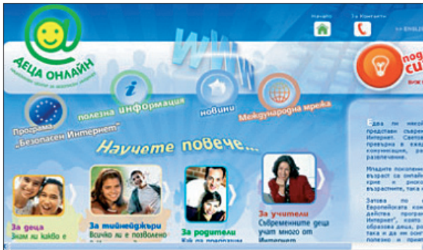
The Safer Internet Center portal

The idea for the “You choose” campaign came from two Bulgarian students who had made their own spot, warning about the hazards of Internet. The spot was re-shot professionally with the participation of the children and the campaign was launched.