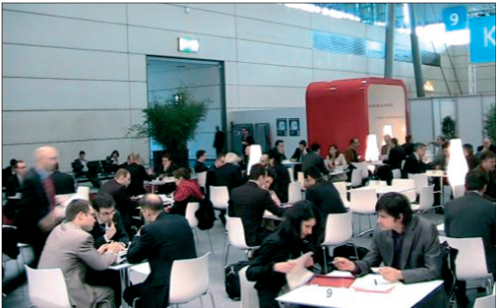
Bilateral meetings during CeBIT, Hannover, Germany