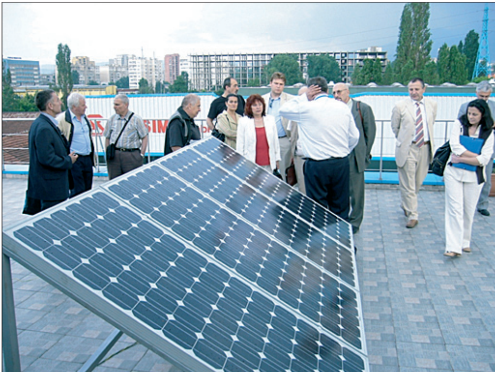
Meeting of the Innovation Business Club at Spesima Ltd.