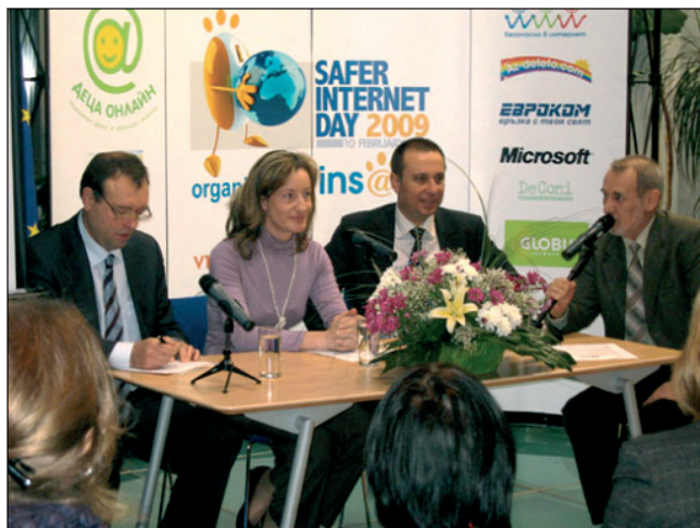
Launch of the second Safer Internet for Children campaign

On February 4, a meeting was held at the Representation of the European Commission in Sofia at which the media were acquainted with the initiatives for marking Safer Internet Day. The three mobile operators Mobiltel, GLOBUS and Vivatel announced the first of its kind SMS campaign, at which nearly 3 million SMS messages were sent to their subscribers on February 10.