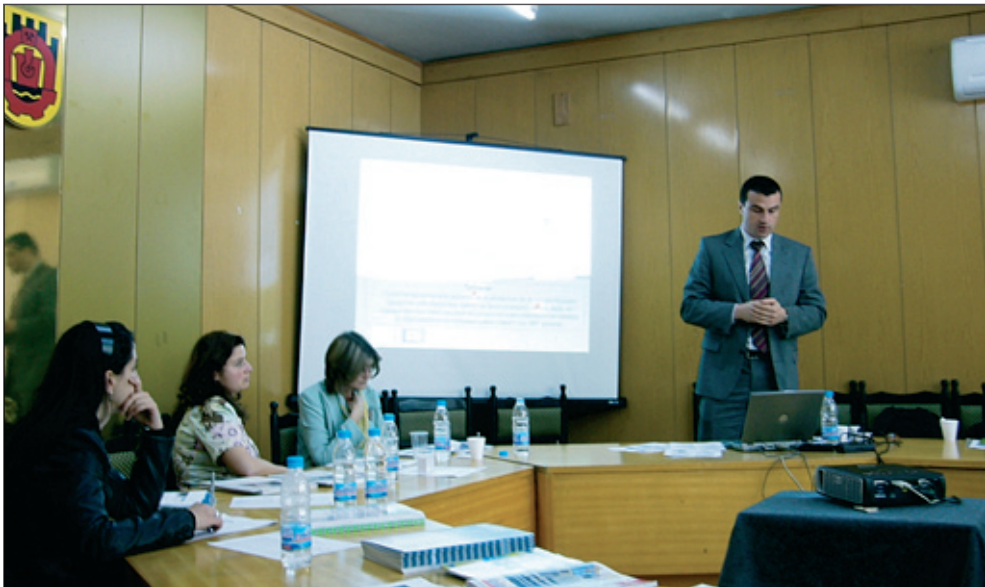
Presentation of European programs for business funding at the Pernik Regional Administration headquarters