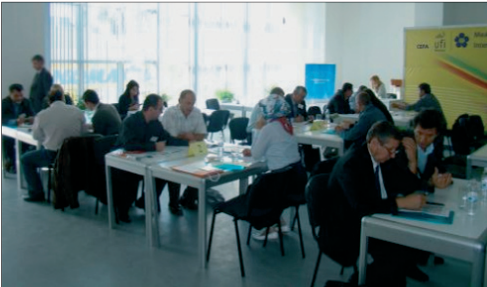
Bilateral business meetings during the autumn International Technical Fair in Plovdiv