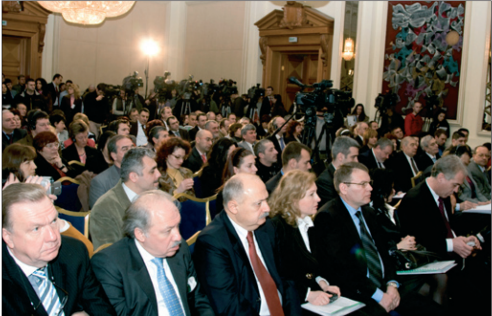
Participants in the Fifth National Innovation Forum

Box 1: Fifth National Contest for Innovative Enterprise of the Year – distinguished participants