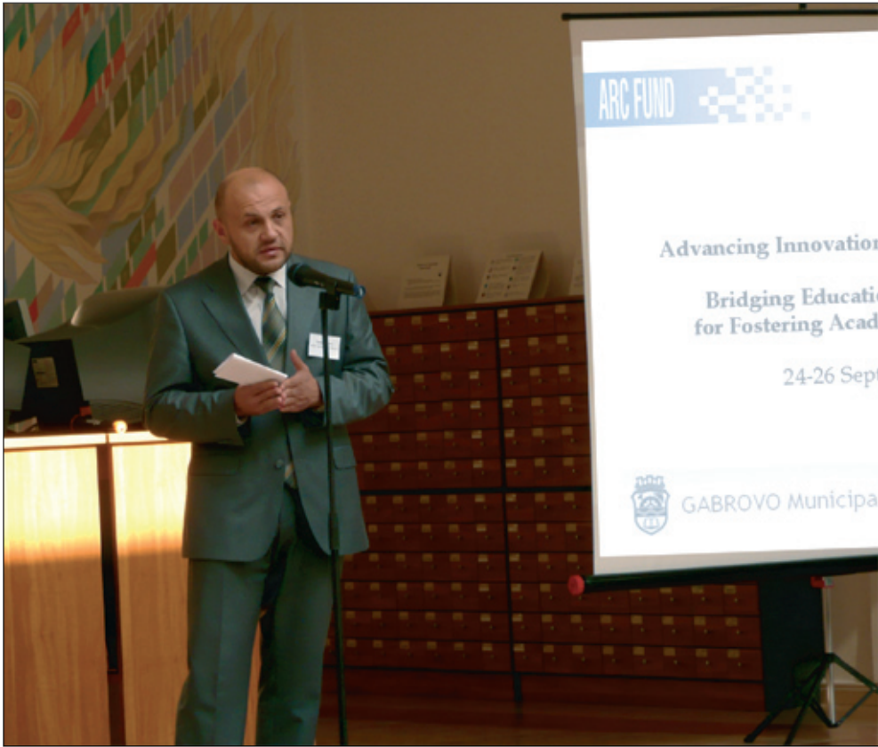
Gabrovo Mayor Tomislav Donchev opens the conference