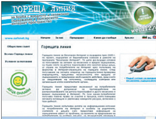
The new design of the Hotline

The new site of the Hotline against illegal and harmful to children content in Internet makes it easier for visitors to submit alerts thanks to the simplified procedure and the guidance of additional information.