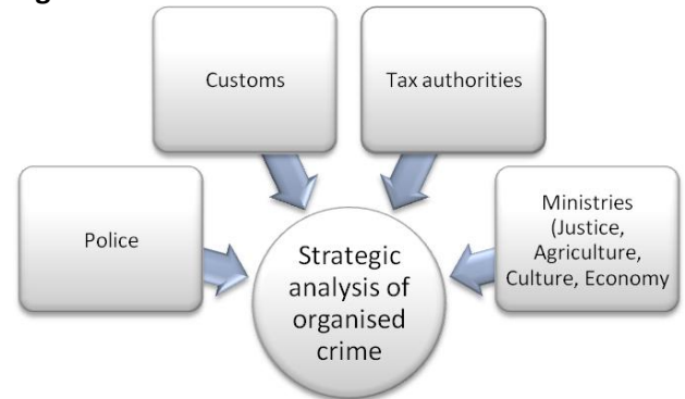
Fig. 2 Institutions involved in OCTA

For the purpose of producing this type of analysis special task groups are formed, that bring together representatives from all the concerned institutions. One example is the production of a threat assessment on the trafficking of people in the UK, as part of the UK threat assessment. The process is led by the Serious Organised Crime Agency (SOCA), but it involves on equal standing the UK Border Agency (which starting from 2009 is exercising the functions of the customs and border police), the United Kingdom Human Trafficking Centre, the Gangmasters Licensing Authority, local police authorities, and other stakeholders.