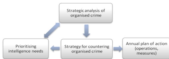
Fig. 1 The process of developing policies to counter organised crime

The process of developing and producing of a strategic analysis of organised crime necessitates the participation of more than one institution. Police often lacks sufficient data about the more general factors, in addition to operative data and macro-information about some areas in the