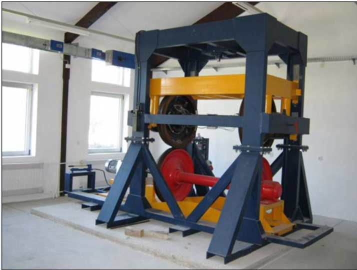
Fig 1. Testing facilities – measurement wheel set