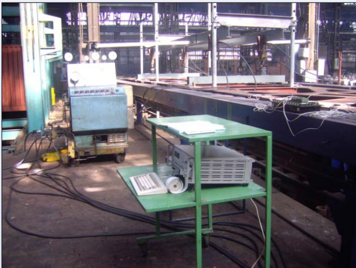
Fig.2. Static testing of lower frame