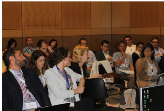
Participants at the workshop “ICT Solutions for Independent Living in Your Own Home”, eHealth Forum 2014 in Athens

The AgeingWell network is open to ICT providers, healthcare service providers, clusters and networks, insurance companies, investors, entrepreneurs, regions and municipalities. Launched in 2012, the network already has more than 80 associate members across the EU from the above-mentioned stakeholder groups.