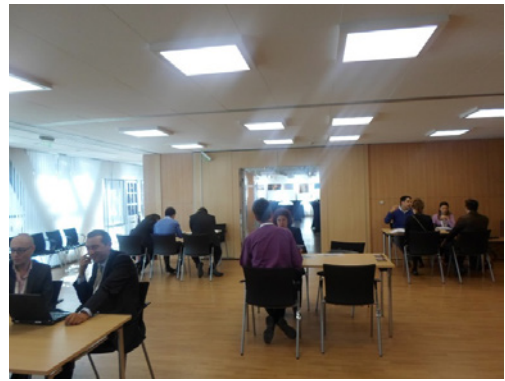
On the left: company presentation during the business mission of Serbian enterprises in So-fia, organized by the EEN in September 2014; on the right: bilateral meetings between mission participants.

In its role as the coordinator of the national EEN consortium, ARC Fund regularly organizes intra-consortium activities, and stakeholder meetings within the framework of the Innovation Business Club and the Association of Business Clusters. It also organizes information days and capacity-building seminars which focus on accessing EU funding for the 2014 - 2020 period, as well as intellectual property protection and business internationalization.