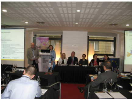
KNOW-HUB Final Conference in Bilbao, November 19-20, 2014

All KNOW-HUB practitioners from the 10 EU regions were involved in a series of Mutual Learning Circles seminars to discuss key issues, challenges and experiences by presenting case studies and good practices. The knowledge exchanged was used in designing implementation plans that were customized for each region and which included specific measures towards smart specialization.