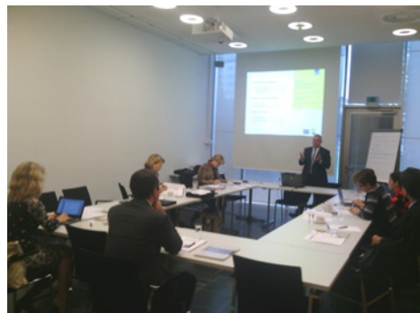
Study visit to Lower Austria region, October 9-10, 2014