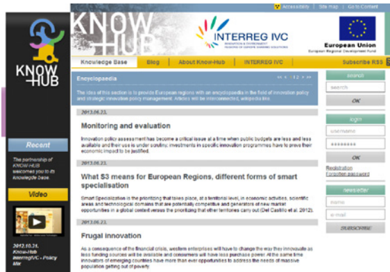
Screenshot of the KNOW-HUB Website

KNOW-HUB delivered two practical guides focusing on the knowledge and good practices identified within the project, as well as wiki-articles selected by the pool of experts mobilized within the project.