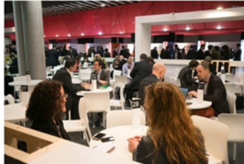
B2B meetings during EEN international brokerage event at CeBIT, Hannover (16-20 March 2015)

very successful "ICT - Go International" brokerage event in Skopje (Republic of Macedonia) – a pilot forum organized by EEN members in South East Europe. Also in November, ARC Fund participated in the H2020 Transport Information Day and Brokerage Event that took place at the European Commission in Brussels.