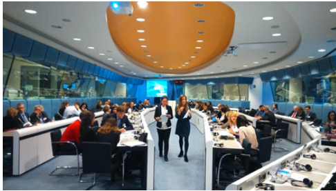
ETNA Plus networking and brokerage event during the Horizon 2020 Transport Information Day (5 November 2015, Brussels)