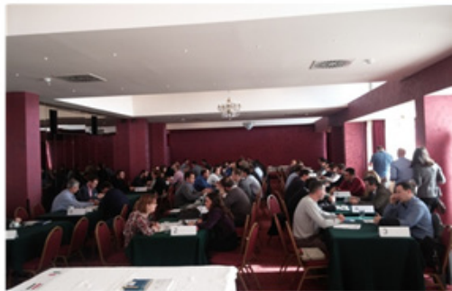
Top left: participants in Go Green 2 Environment brokerage event in Inter Expo Center Sofia (13 March 2015); top right: cluster conference in Varna, co-organized by Enterprise Europe Network at ARC Fund (12 June 2015); bottom left: meetings during the ICT Company Mission in Gothenburg (Sweden), co-organized by Enterprise Europe Network at ARC Fund (22 October 2015); bottom right: ICT Go International brokerage event in Skopje (Republic of Macedonia) (13 November 2015).