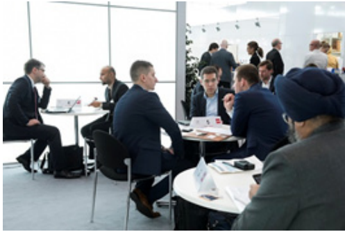
B2B meetings on the EEN stand at Mobile World Congress, Barcelona (2-4 March 2015)

global ICT event, during which the EEN team at ARC Fund co-organized business-to-business meetings, was Horizon 2020 ICT Conference in Lisbon in October. Other five Bulgarian companies had the opportunity to arrange almost 60 meetings with future R&D partners and business clients. In November, ARC Fund participated in the