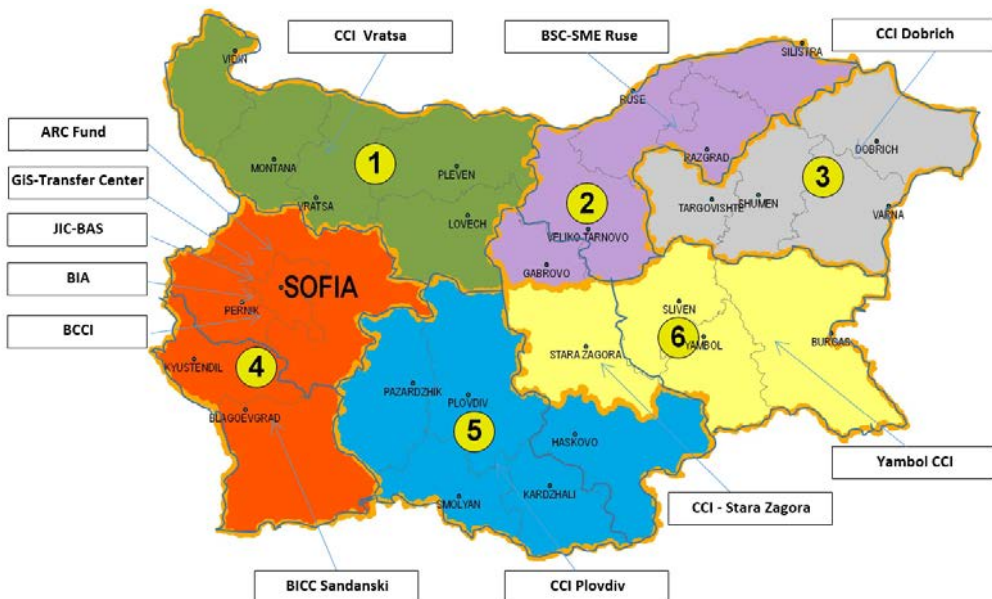
Map of EEN-Bulgaria nodes

At the same time, EEN serves also as a gear between the European SMEs and the EU institutions. The European Union runs various programs and initiatives that offer financing and development support to SMEs, which the 4,500 EEN advisors promote among entrepreneurs, often