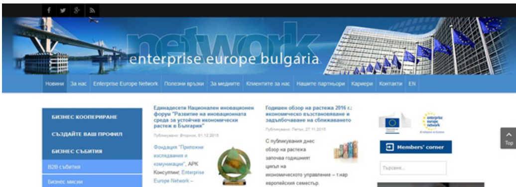
The new website of Enterprise Europe Network – Bulgaria

As in previous years, in 2015 ARC Fund was among the co-organizers of the International Brokerage Events at the Mobile World Congress (in Barcelona, March 2015) and CeBIT (in Hannover, March 2015) – leading international events in the mobile communications and ICT industry. Five Bulgarian ICT companies took the opportunity to visit the exhibitions at preferential conditions (reduced participation fee, participation in parallel events, professional consultations in the fields of industrial property, project financing, etc.) and to conduct fruitful negotiations on-site with potential suppliers of new products and technologies. Another