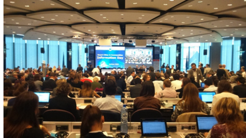
ETNA Plus participation in the Horizon 2020 Transport Information Day (5 November 2015, Brussels)