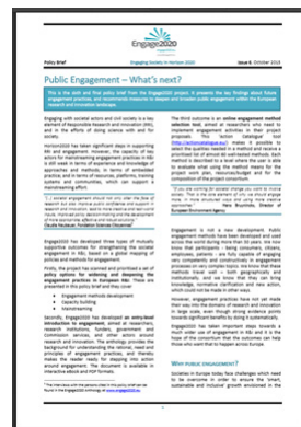
Engage2020 Policy Brief, Issue 6 (October 2015)

The organization also coordinated the development and publication of a total of 6 policy briefs on different aspects of public engagement. These policy briefs were based on the results of the analysis conducted in the frame of the project and summarized the most pertinent conclusions, reached by project partners. The policy briefs are available at: http://engage2020.eu/publications-page/ .