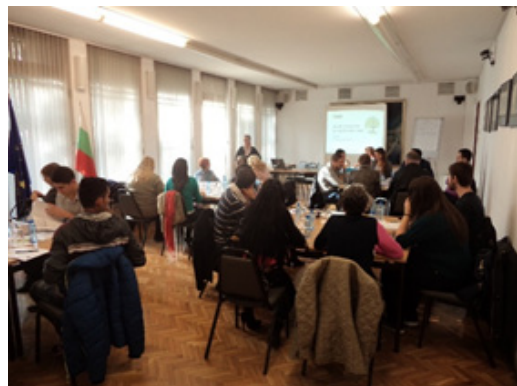
Second national Citizen Panel in Sofia, Bulgaria (17 October 2015)