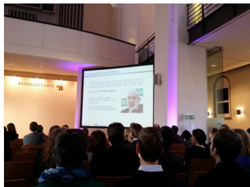
Second European Technology Assessment conference in Berlin, Germany (25 February 2015)

ARC Fund takes special pride in being a pioneer in championing the concept of technology assessment and practice within the domestic policy discourse. We build on our strong track record in supporting the development and implementation of innovation policies, in performing high-quality applied research, in networking with policy institutions and science centers, and in mainstreaming technological advances and solutions.