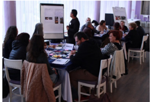
National Citizen Vision Workshop in Plovdiv, Bulgaria (22 November 2015)