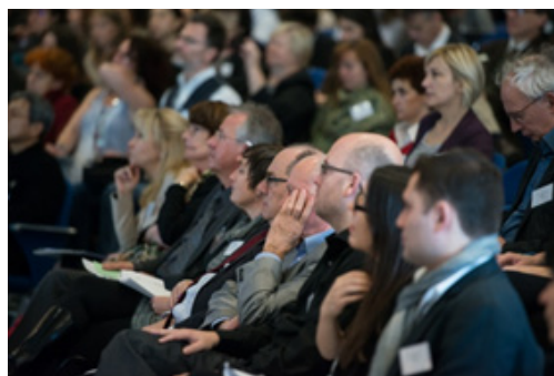
SI-Drive Conference “Social Innovation 2015: Pathways to Social Change” in Vienna, Austria (18 November 2015)