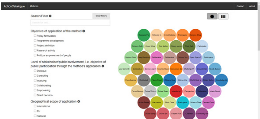
Engage2020 Online Action Catalogue