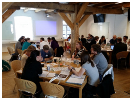
CASI Expert workshop in Copenhagen, Denmark (8 June 2015)